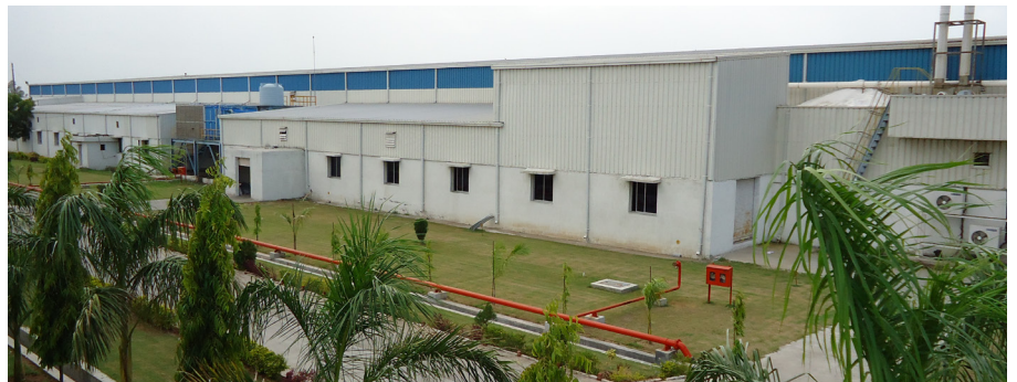
VADODARA - INDIA

BOPP Films: 1,96,000 TPA CSP : 7,200 TPA CPP Films: 27,000 TPA BOPET Films: 30,000 TPA PET G Films: 14,000 TPA Thermal Films: 40,000 TPA Coating Films: 30,000 TPA Metalized Films: 41,000 TPA