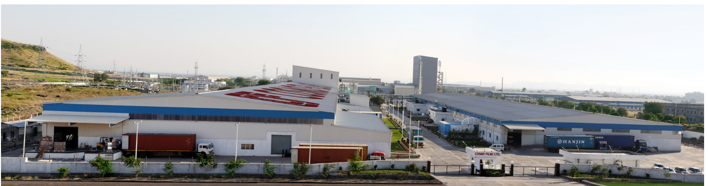
SEZ UNIT, AURANGABAD, INDIA

* 10 th BOPP line to be commissioned by March, 2025