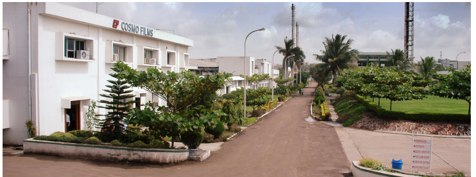
AURANGABAD - INDIA

9 BOPP Production Lines* 1 CSP Line 3 CPP Lines 1 BOPET Line 6 Thermal Lamination Lines 8 Gravure Coating Lines 8 Metalizers